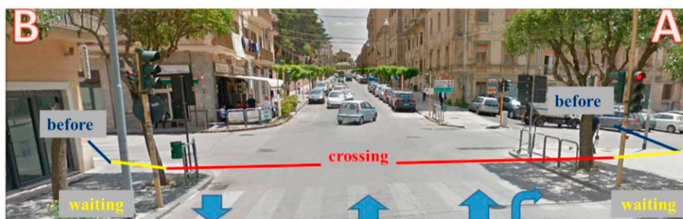
Fig. 1. Monitored pedestrian crossing in Enna (Italy)

A survey campaign through the use of video cameras was carried out at urban location of Enna city in the centre of Sicily (Italy) during the period 08March 2021-14 March 2021. The monitored area is characterised a 4arms intersection and by 4 crossings on either side of the intersection, one of which is the most crowded and was the subject of this study with traffic light regulation near offices and schools. It is possible to define 3 observation phases, namely in the area before crossing (Phase A), in the waiting area (Phase B) and during the crossing (Phase C), as shown in Figure 1. is characterised by 4 crossings on either side of the intersection, one of which is the most crowded and was the subject of this study