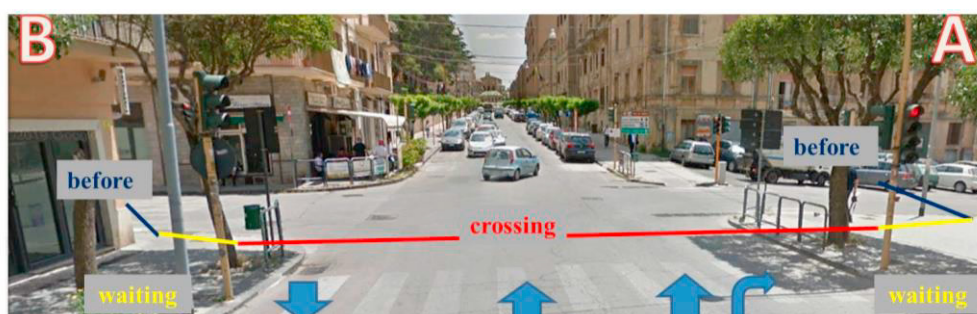
Fig. 1. Monitored pedestrian crossing in Enna (Italy)

A survey campaign through the use of video cameras was carried out at urban location of Enna city in the centre of Sicily (Italy) during the period 08March 2021-14 March 2021. The monitored area is characterised a 4arms intersection and by 4 crossings on either side of the intersection, one of which is the most crowded and was the subject of this study with traffic light regulation near offices and schools. It is possible to define 3 observation phases, namely in the area before crossing (Phase A), in the waiting area (Phase B) and during the crossing (Phase C), as shown in Figure 1. is characterised by 4 crossings on either side of the intersection, one of which is the most crowded and was the subject of this study